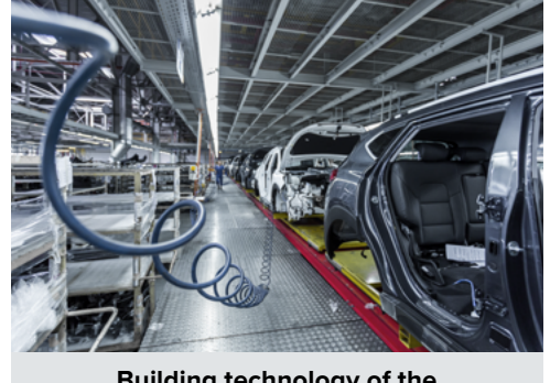
Building technology of the automotive industry