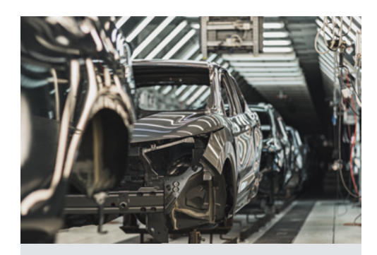
Power supply for the automotive industry