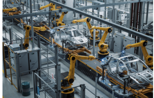
Plant technology of the automotive industry